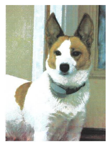
Way too big ears.