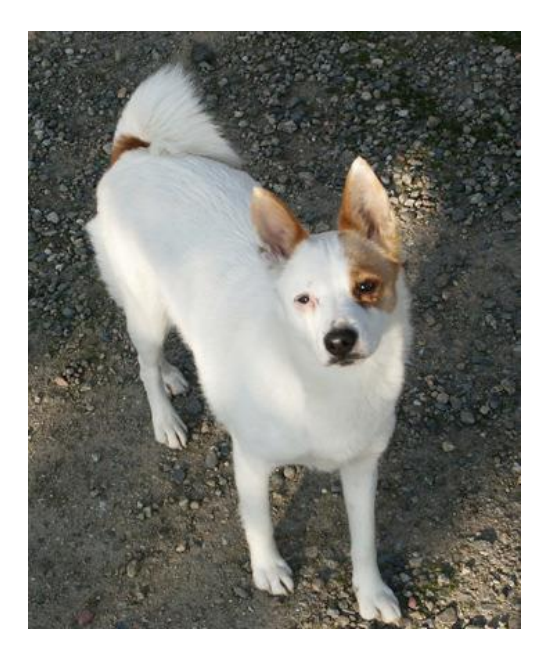
Colour on one side of the head only.