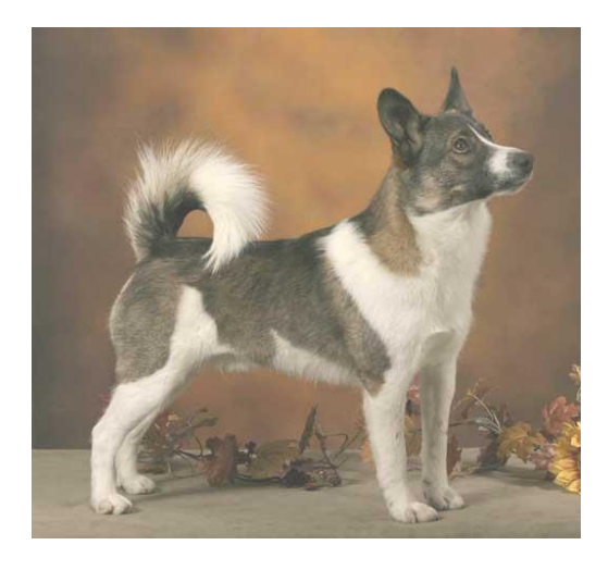
Not correctly distributed patches. Agouti colour.

• Examples of dogs where the colour might be tolerated, but the markings are not: