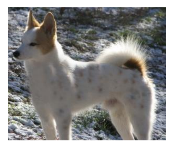
Correct colour but no patches on body, only ticking (severe fault).

This dog has correctly distributed patches, but black colour, tan markings and ticking (last two being severe faults).