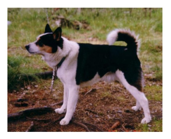
Not correctly distributed patches, black colour and also tan markings (severe fault).