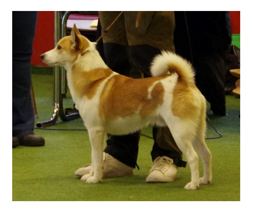
Male of excellent breed type but a little straight in stifle.

Female of excellent breed type but a little straight in angulation front and rear.