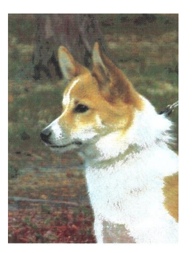
Big forward tilted ears.