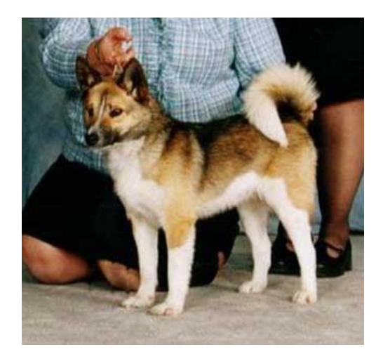
Not correctly distributed patches. Fawn colour.