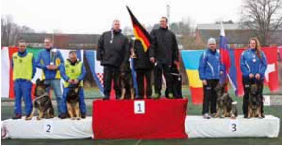
Country teams 1st place and FCI World Champion 2013: Germany, with 385 points 2nd place: Sweden with 189 points 3rd place: Slovakia, with 187 points