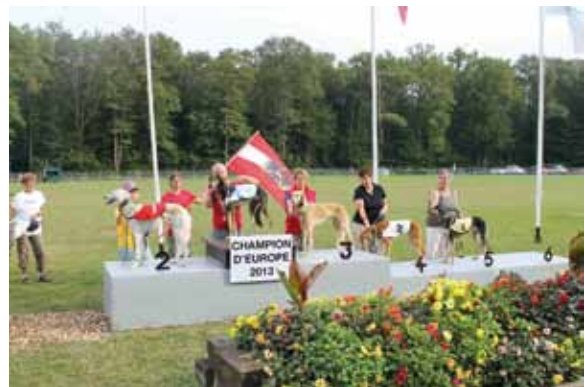
Saluki Laaibah of Falconers Dream – Wiehser (AT)