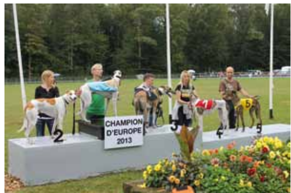
Magyar Agar Thajra Erdesz – Leman (DE)