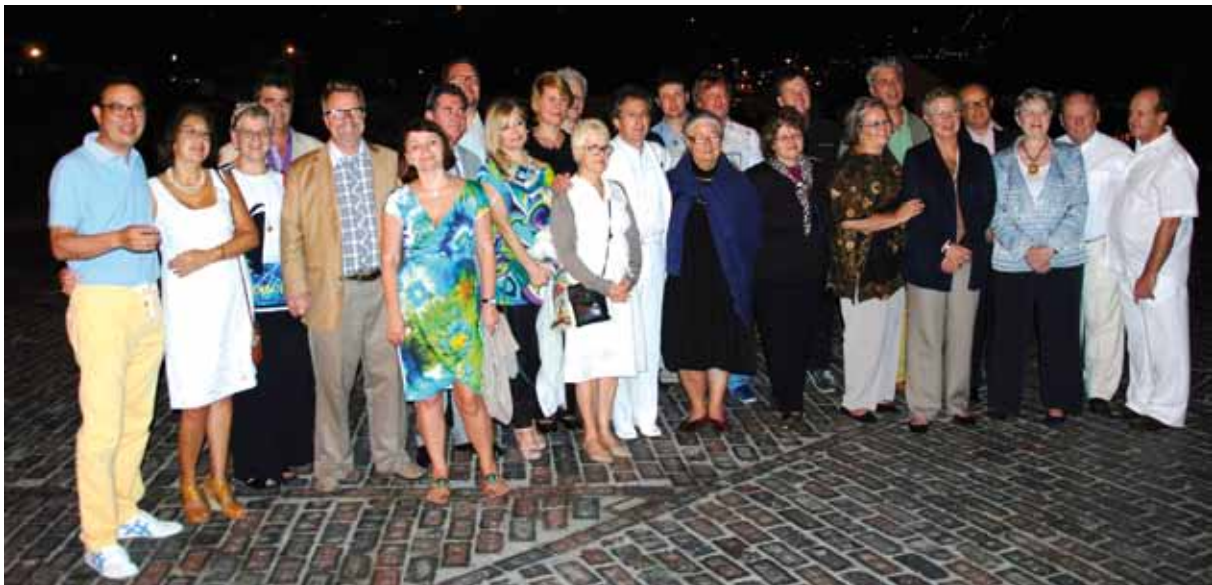
Some of the delegates on sightseeing in Cartagena

The Colombian canine organisation hosted the FCI Show Commission's annual meeting first weekend in February together with the FCI Show Judges Commission. This was the first time this meeting was held outside Europe. The commission has during the last five years worked on the revision of the FCI Regulations for Dog Shows which was accepted by the FCI General Committee and made valid from 1.1.2013. In the process of working with the new regulations where delegates from two different South American and one Asian Country took active part, it became obvious that the cultural variety in the vast number of FCI countries is a major problem when discussing and trying to agree on regulations that shall include all countries in the organisation. The ambition of accepting the Colombian canine organisation's wish to host our annual meeting was to bring the discussions closer to the South American member countries and we had hoped that much more of the member countries from this region would have taken the opportunity to express their views on the commission's work. As it turned out it was still only delegates from Colombia and Uruguay that attended the meeting.