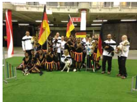
The German Team with the African dancers