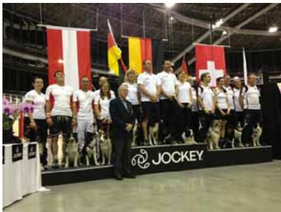
Winning team Large - agility run: 1 st Germany, 2 nd Switzerland and 3 rd Austria