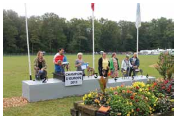
PLI Fifablue del Buffone – Toma (IT)